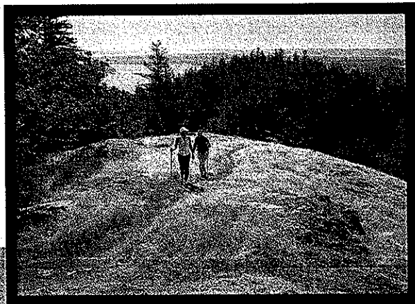
Denver's Confluence Park. ABOVE Turtleback Mountain Preserve on Orcas Island, WA.

3 CORONADO, CA Your dog can ride the waves at the Su-Ruff Camp hosted by Loews Coronado Bay Resort ( loewshotels.com or 800/815-6397), 20 minutes