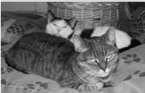
Sponsor cat Noel , above - Sponsor cat Roxy , front cover

Although unwanted, these cats are still protected by the Humane Society of Ocean City's "no-kill" policy.