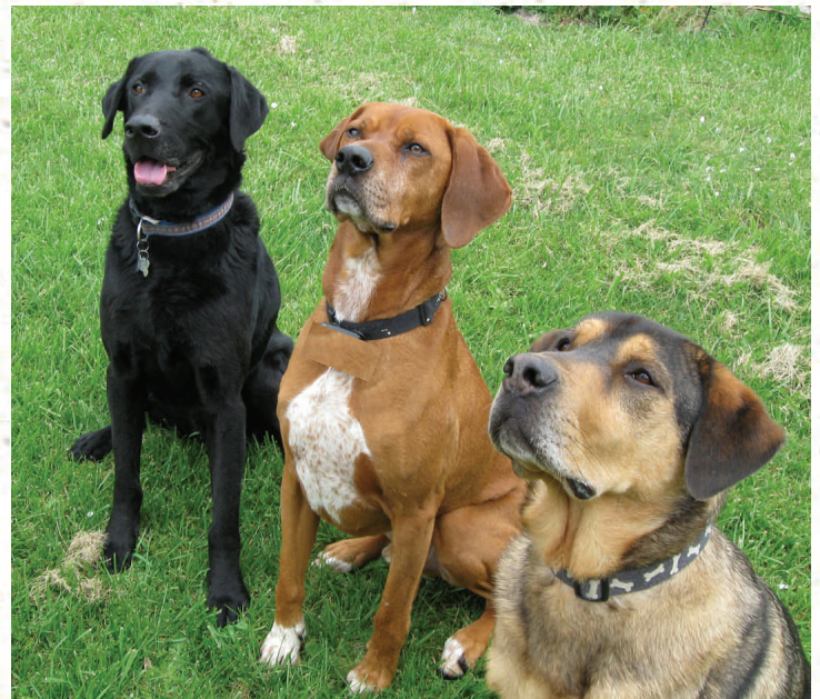
Senior dogs make great pals! These three are some of the many who have been helped by SDRO.