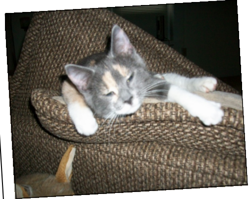
Versace is so happy In her new home!

Her wonderful personality is definitely a tribute to your organization, and we are so happy to have her in our family!"