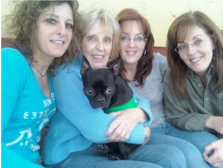
Olivia's new family!!