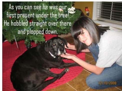
As you can see he was our first present under the tree! He hobbled straight over there and plopped down.