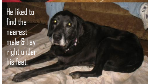
He liked to find the nearest male & lay right under his feet.