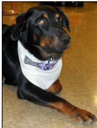
Leonard is a 2 year old Rott/Lab mix. He is house trained and is enjoying obedience training in his foster home. He knows how to sit, lie down, shake, and stay. He has excellent manners and is a delightful dog!

At the beginning of November, there were 107 dogs listed in the "Adoptable Dogs Off Site" area of our website. While we can't shine the spotlight on all of these stars, here are just a few of our off site dogs. All of these dogs need good, permanent homes with loving families.