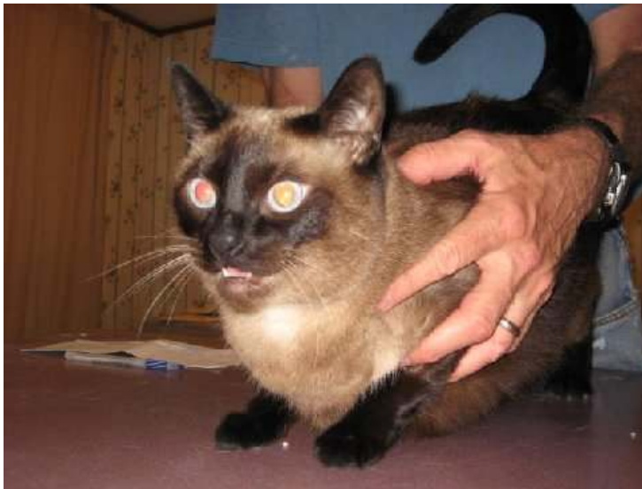
Delighted, not Demonic!!

While this kitty doesn't look so happy about it, she does get to sleep, eat and be photographed in the pleasant surroundings of her new adoption center at the Clay County Animal Shelter. What the picture doesn't tell is that she is really grinning, not snarling, but we thought it would be good for a grin from you, too.