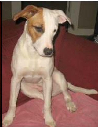
Pinky is a 2 year old Pointer mix. She strayed to a home at Thanksgiving of last year. It is sure time to find her a new home, hopefully one with lots of people (and kids!) because she loves to snuggle with people!