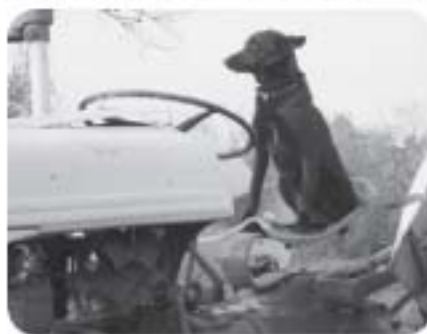
the Lake Arrowhead Dam Tractor Ride and Show