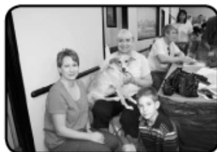
Sandy with her foster family and her adopter that happy day at PetSmart®