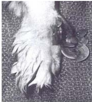
Regrowth of claws associated with inadequate amputation of the third phalanx of the first digit