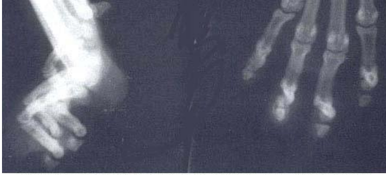
Radiographs depicting inadequate amputation of the third phalanx in a cat with regrowth of claws following onychectomy. When there is evidence of regrowth at one site, it is common to find an excessive amount of the third phalanx remaining at additional sites.