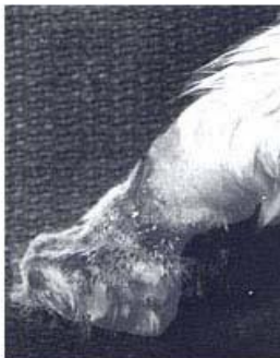
Necrosis and sloughing of soft tissue following onychectomy

"One hundred sixty-three cats underwent onychectomy..... Fifty percent of the cats had one or more complications immediately after surgery. Early postoperative complications included pain..., hemorrhage..., lameness..., swelling..., or non-weight-bearing..... Follow-up was available in 121 cats; 19.8% developed complications after release. Late postoperative complications included infection..., regrowth..., P2 protrusion..., palmargrade stance..., and prolonged, intermittent lameness...."