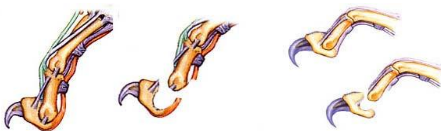
Adapted from Atlas of Feline Anatomy for Veterinarians; Hudson/Hamilton, W.B. Saunders Co.

The below is a clinical description of the the declawing surgery taken from a leading veterinary surgical textbook. Contrary to misleading information, declawing is not a "minor" surgery comparable to spaying and neutering procedures, it is 10, separate, painful amputations of the distal phalanx at the joint ( disjointing ).