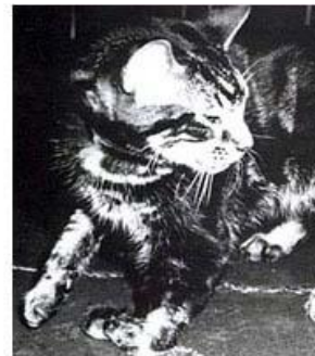
Radial neuroparaxia associated with onychectomy