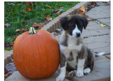
"Tater" was a foster puppy who transported to NEAS last month!

PO Box 343, Union, WV 24983 304-772-4445 - information line mcalwv@hotmail.com ~ mcal.petfinder.org