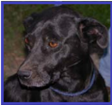
Ebony tested heat-worm positive. She needs a quite home to recoup. Treatment for heart-worms is expensive. Sometimes a second treatment is required.

This is a time of extreme hardship for organizations who depend on donations to operate. Money is tight and, understandably, is being handed out sparingly. MCAL is feeling the effect. We have many long-term foster animals, and many animals in need of specialized care. A few of these animals are highlighted through out this newsletter. As a group, we maintain a no-kill philosophy. All animals in our care will receive the medical attention required and will stay in foster care until a forever home is found. We will not put an animal to sleep because it costs too much to make them well again or because they're taking up foster space. Please be generous with your donations. Their lives depend on it!